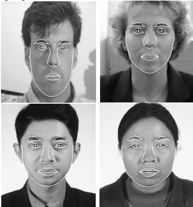
Fig.3. Results of the proposed ESL method.

Some experimental results of our method are illustrates in Fig.3, from which good performance of the proposed method can be seen. Moreover, ESL has the potentialities to extend to faces from different races, under various lighting conditions, and even for occlusion situations.