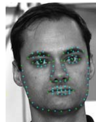
Fig.1. An example of feature points labeling. The face image is from CMU-PIE database [14].

If the pose of the image is identical, the normal map of a given face can be obtained by aligning the face image with an average face normal map of that pose, because human faces share similar shape. First the feature points in the face image are labeled automatically with an improved ASM method [16]. Then the face image and the normal map are aligned with image warping technique based on feature points. An example of the feature points labeled is given in Fig. 1.