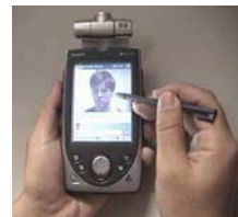
Figure 2 HP Jornada pocket PC with HP pocket camera

The current PDA market is shared by Palm OS based PDA and WIN CE based PDA. Some PDAs can attach a camera. For example, Palm M100/M105 can use the KODAK PALMPIX camera. SONY CLIE NR 70 even has an embedded camera. Among WIN CE based systems, HP JORNADA 54X and 56X serials can attach a camera, and CASIO PDAs can use its JK-710DC Digital camera card, which can be used by almost all CASIO PDAs. Having considered computing power, memory size, and availability of camera as an accessory, we have chosen HP Jornada Pocket PC as a platform for developing a prototype system. The HP JORNADA 568 is configured with a 206MHz StrongARM CPU and 64MB RAM which is shared by storage and program space. It provides a CF type I slot which can attach a camera as an imaging device. It provide a 320x240 LCD with 65536 colors. Figure 2 shows an HP Jornada Pocket PC with an HP pocket camera.