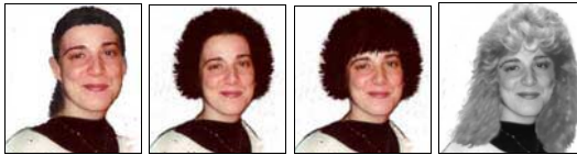
Figure 6 The composed pictures by Washington police