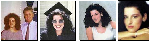
Figure 5 Chandra Levy pictures found from Internet

To test recognition accuracy, we collected data from our lab using this system. We collected a total 116 pictures for 24 people under various lighting conditions and in different poses. We randomly selected one image from each person for training and the rest for testing. The recognition accuracy is 81.25%, if the system considers only top one choice. In a PDA-based based face recognition task, a user can help to make decision from an N -best list provided by the system.