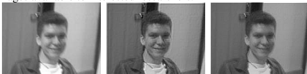
(a) (b) (c) Figure 3 An example of image enhancement

We have performed many different experiments to study image processing and face recognition algorithms and demonstrate feasibility of the hardware. We use public available databases for algorithm evaluations to make it comparable with other research. We use images taken by the hardware of our prototype system to demonstrate feasibility of the system, and we will make those images available to interested researchers.