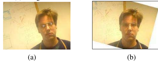
Figure 1 An example of rotated head and its recovery

We use normalization methods to deal with variations in scale, head rotations, and lighting. In a PDA-based application, a user has a certain freedom to find an optimal position to capture an image. For example, a user can try to capture a front face instead of a side face. However, we cannot always capture every person's head always up straight. Furthermore, there is no guarantee that a user can hold the PDA perfectly horizontal. This will result in a head rotation on the image plane as shown in Figure 1(a). Such a rotation will decrease the performance of a face recognition system. The alignment can be made from facial features. Figure 1(b) shows the result of normalized image in scale and rotation from the image of Figure 1(a) using the locations of the irises.